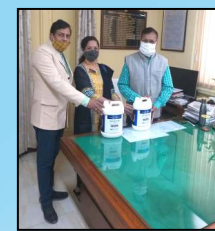
25th January Sanitizer to Reserve Force Kolkata Police