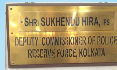
25th January Covid Help