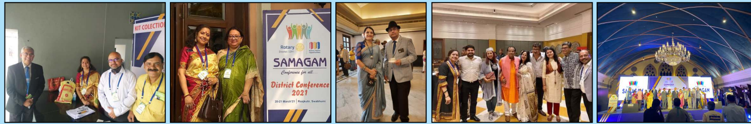
DISTRICT CONFERENCE SAMABESH