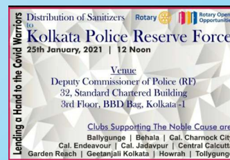
25th January Project