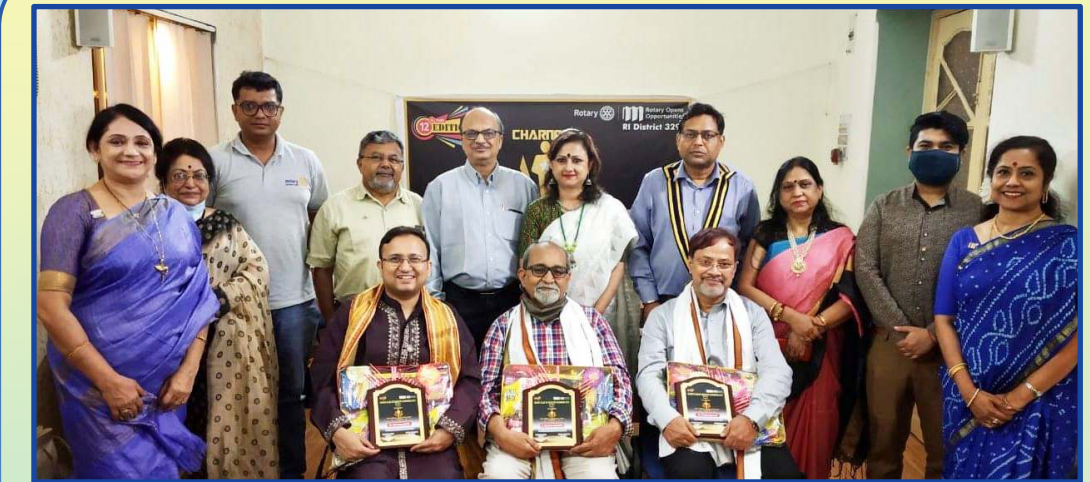
12 th CHARNOCK VOCATIONAL EXCELLENCE AWARD