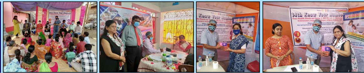
KNOW YOUR NUMBERS